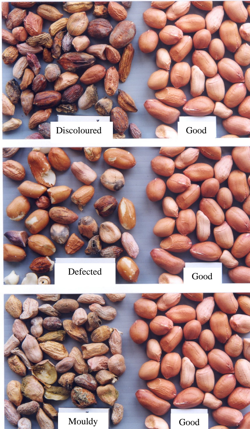
Figure C.4 Defected peanut kernels compared to good quality kernels