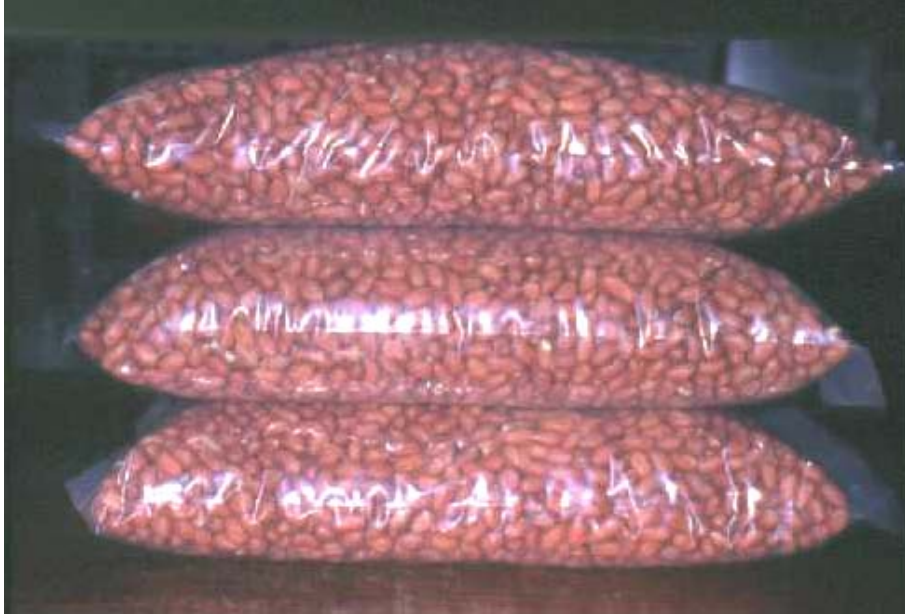
Figure C.2 Dried peanut kernels in plastic bags stacked on a pallet without direct contact to the floor