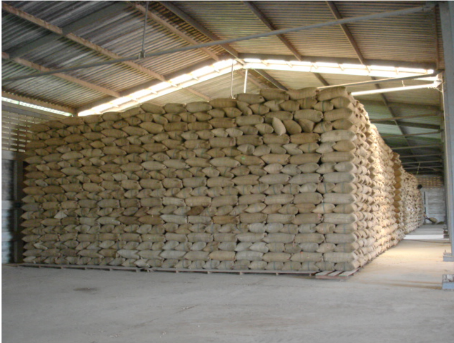
Figure C.3 Dried peanut kernels in gunny bags stacked on a pallet without direct contact to the floor