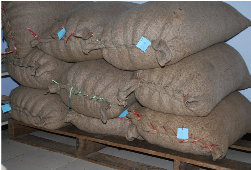
Figure C.1 Dried in-pod peanuts in gunny bags stacked on a pallet without direct contact to the floor